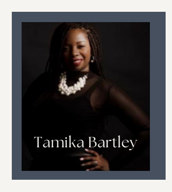
19 years in Education Secondary Curriculum Coordinator Reading & Writing Sheldon ISD